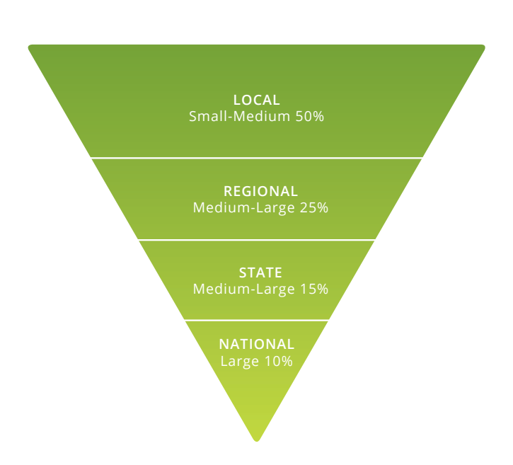
Figure 1: Proposed allocation of funding investment for the new Landcare model

A new national approach should encompass: