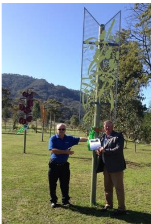
ABOVE: New banners at Wilson Oval