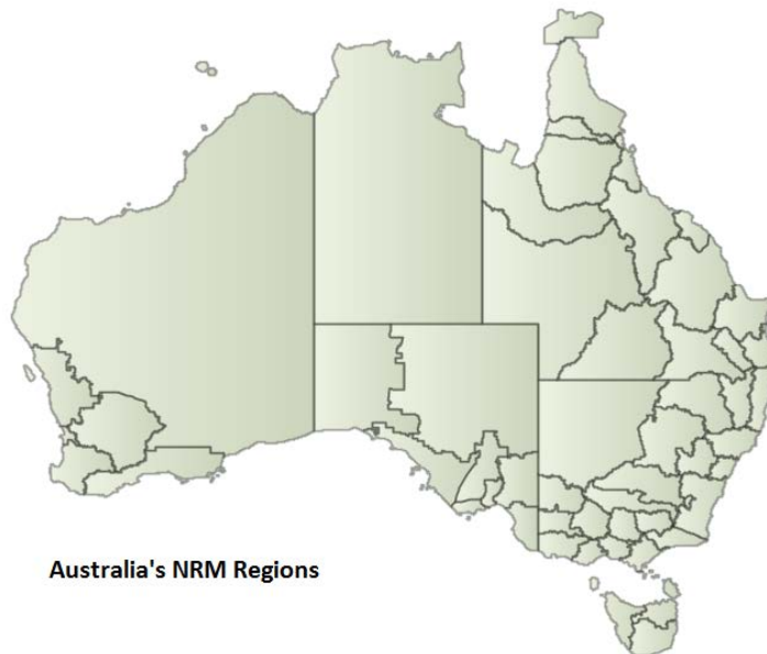
Australia's NRM Regions

56 Chairs of regional NRM bodies hold an annual national Forum to provide a collective opportunity to: meet with government and other stakeholders; report on progress against the annual work plan; and to set direction for the NRM Regions Australia the following year.