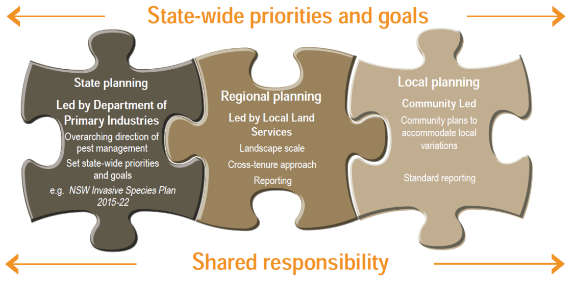
Figure 9. Relationship between local, regional and state planning

Our approach to viewing the plans is built upon the principles articulated in the Natural Resources Commission's Review in to Pest Animal Management, as outlined in Figure 1 below, and is based upon 25 years of Landcare practice in community consultation and project design.